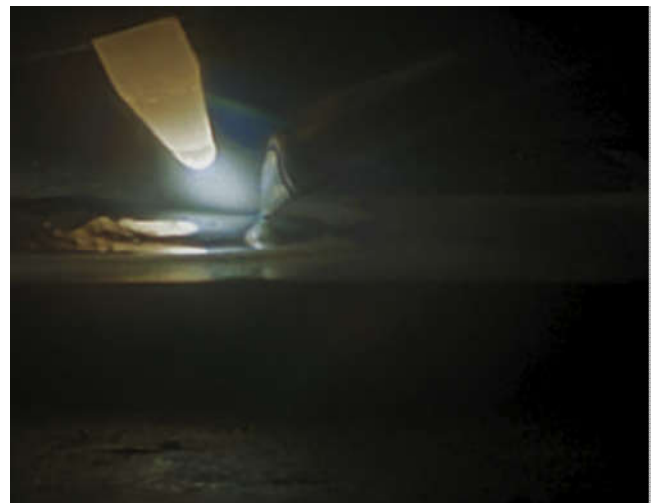
Actual V2000-U – TIG on Aluminum