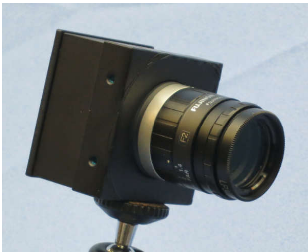
V2000-U Color USB-3 Camera with C-Mount Lens (lens not included)

All this is accomplished without special filters or optical tricks, allowing the arc to be anywhere – not just in the center.