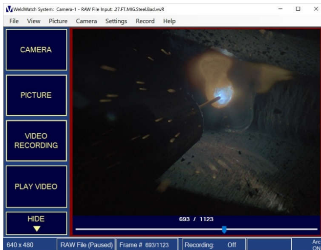
WeldWatch Software Screen-Shot